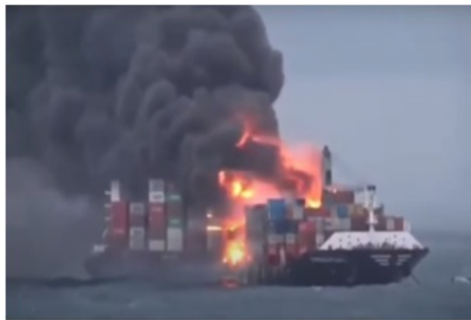
MV Express-Pearl Fire to help keep fires going

A major fire ignited onboard MV X-Press Pearl, a container carrier ship anchored about 9 nm from Colombo port, Sri Lanka on AM 25 May 21. The vessel enroute from Hazira to Colombo and loaded with 1486 containers carrying about 25 tons of hazardous nitric acid and other chemicals. The ship was manned by 25 crew including 5 Indians, all of whom have been evacuated.